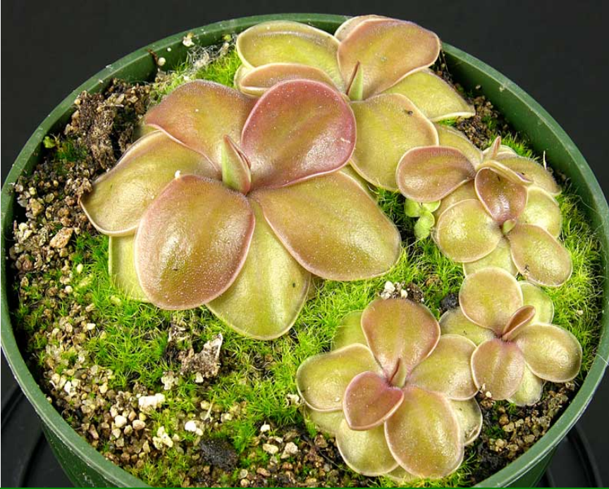
Pinguicula moranensis var orchidioides