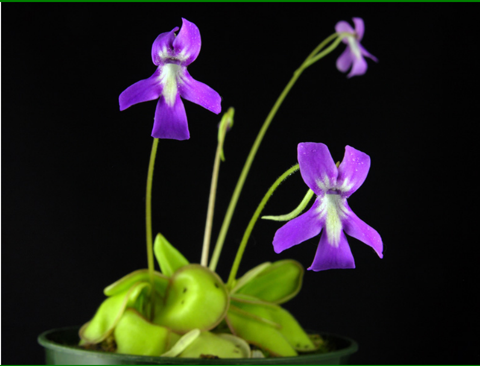
Pinguicula sp 'Köhres'