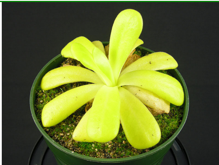
Pinguicula agnata 'True Blue'

At this time of year, we find that we have overstocked several of our plants. Therefore we are able to offer you special prices on these for a limited time only. I would like to direct your attention to this feature of our website, the Specials page. To go directly to the Specials page, click here . Currently, special prices are available on the following species: