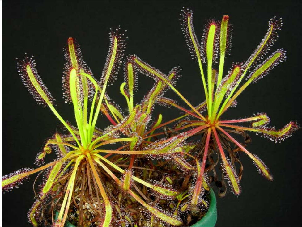
Drosera capensis "Broad Leaf"

Thank you for your continued interest and support!