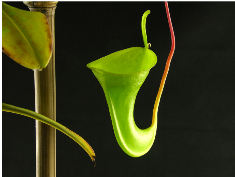
Nepenthes inermis – upper trap on a nearly mature plant

Please note: The following pictures are intended to be representative of the plants we sell, and in many case are larger and more highly developed specimens than the plants in our catalog.