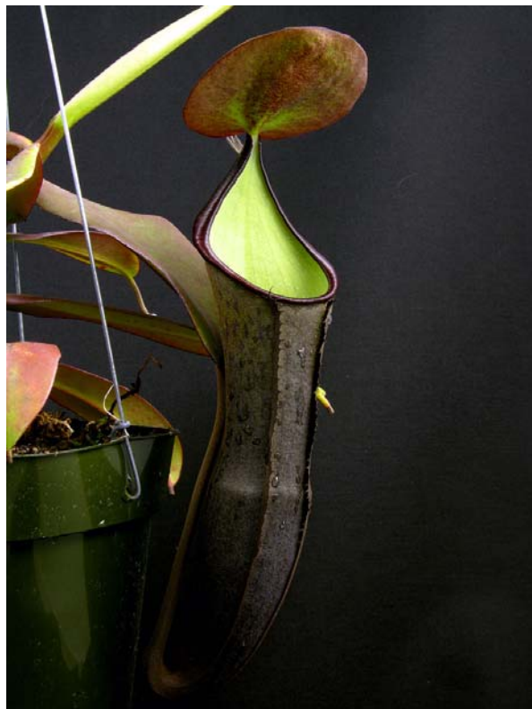
Nepenthes ramispina - 8" Pitcher